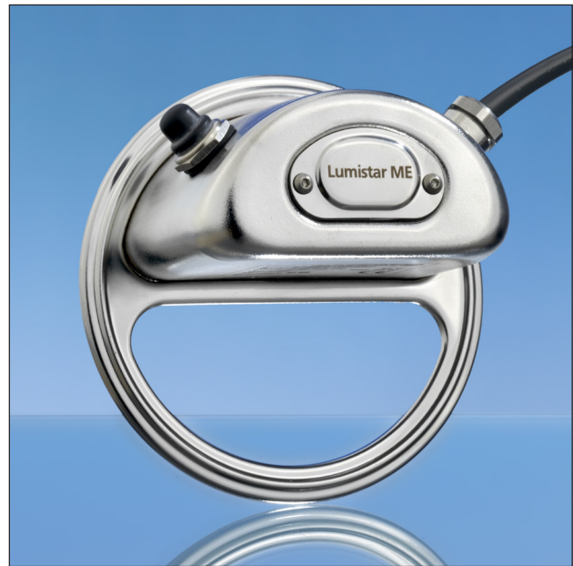
Lumistar luminaire crescent design ME